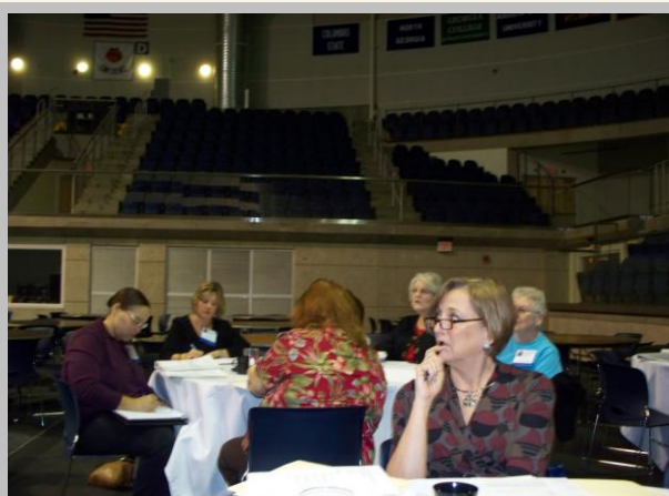
Rapt Coalition members and staff listen to speaker comments at breakfast presentation.