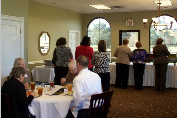
Southwest Georgia CARE-NET members enjoy their quarterly luncheon meeting at the Grand Island Golf Club in Albany.